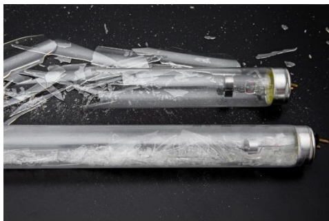
Anti-splashing foil protection